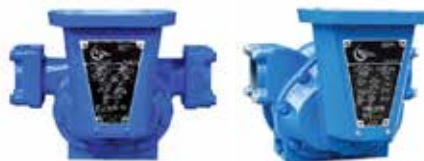
FLOW METERS (Fuelco, TCS)