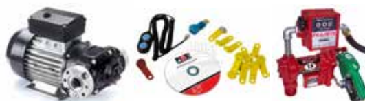
PUMPS & KITS (Fuelco, PIUSI, FILLRITE)