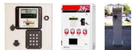
FUEL MANAGEMENT SYSTEMS