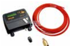
FLUID MONITORS (Fuelco, PIUSI)