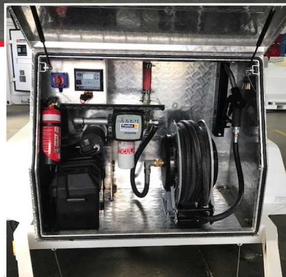
Bunded Pump with fittings