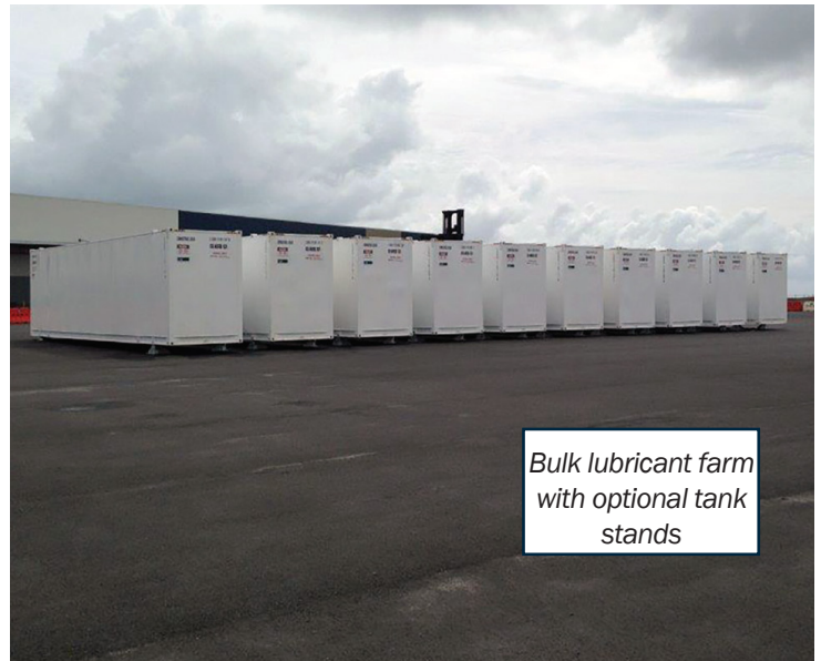
Bulk lubricant farm with optional tank stands

Disclaimer: Information and photographs shown are for marketing purposes only. Actual product may vary to images shown due to continual improvement processes, design changes and optional extras